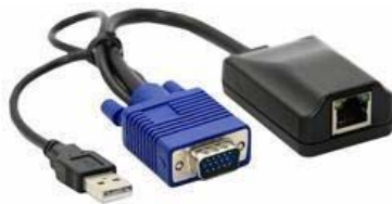
16 pieces USB KVM Dongle